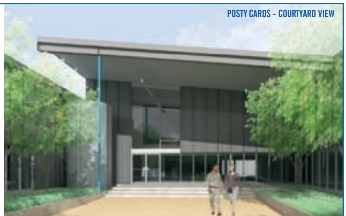
POSTY CARDS - COURTYARD VIEW

LEED ACCREDITED PROFESSIONALS RESIDENTIAL COMMERCIAL CIVIC