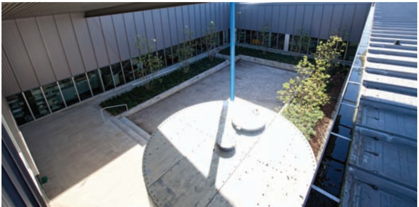
A view from above the Posty Cards courtyard shows the top of the water tower that will be used to water trees and plantings in the area.

“We tend to be low-key, but we also have a big vision for the role that small businesses can play in a more sustainable future,” Jessee says. “We’re pleased that Posty Cards can be a role model for what small businesses can do. Collectively, the decisions that small businesses make will have a huge impact on how quickly we as a country reduce our energy consumption. It is vitally important that businesses begin taking advantage of increasing opportunities to make their operations more efficient.”