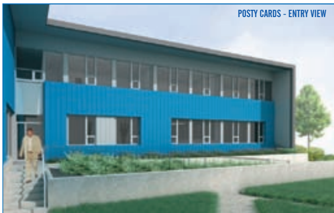
POSTY CARDS - ENTRY VIEW

Flashing & sheet metal trim insulated exterior sheet metal, insulated panels, 30% recycled content 913-782-4900 www.wcw-son.com